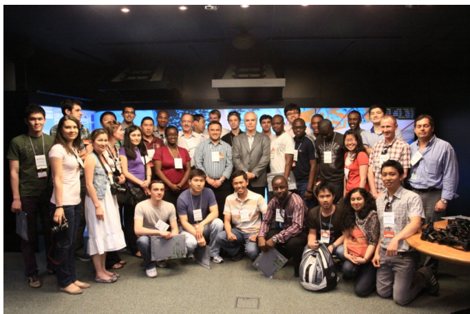
Imperial College 2010 field trip to Brazil

The Student and Scholarship Committee has provided funding for library books and SPE One-Petro for Universities, Arkwright Foundation scholarships Imperial College field trips. The London Section sponsors Student Chapters at Imperial College, London Southbank University, University of Leeds, University of Manchester, University of Salford and University of Portsmouth. We welcome students to attend our evening meetings at a highly subsidised rate.