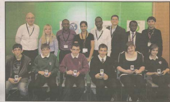
TOP STUDENTS: The winning team of pupils from the business challenge and their prizes with industry professionals from SPE Aberdeen who helped the pupils throughout the day.